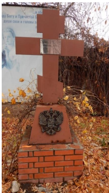
Fig. 2. The Cross of Worship, installed at the initiative of the Siberian Cossacks. The Tsarskaya Pristan Center (Tyumen, 3, Gosparovskaya Str.). November 3, 2022