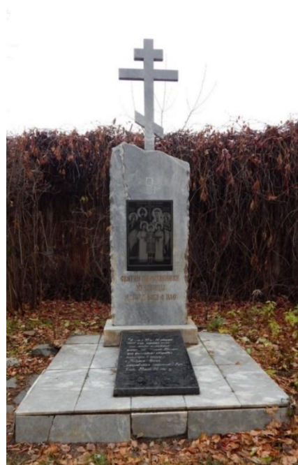
Fig. 3. The Cross of Worship, installed at the initiative of parishioners. The Tsarskaya Pristan Center (Tyumen, 3, Gosparovskaya Str.). Photo by E. Makarov, November 3, 2022

Despite the presence of navigation signs leading to the “Tsarskaya Pristan” in the historical part of Tyumen [42], these signs are inaccessible to most tourists and residents of the city. The monumental objects are visited by people who have visited the exposition or individual persons who want to worship the crosses. On the other hand, citizens, who visit this place, receive information from its employees about the purpose of the signs and about the persons memorialized by their installation. Explanations are especially relevant in case of mistaken perception of signs as a grave place. Perhaps, the reason is the view of the signs, which resemble graves, as well as the tradition in the Russian Orthodox Church of burying priests on land adjacent to city temples or monasteries.