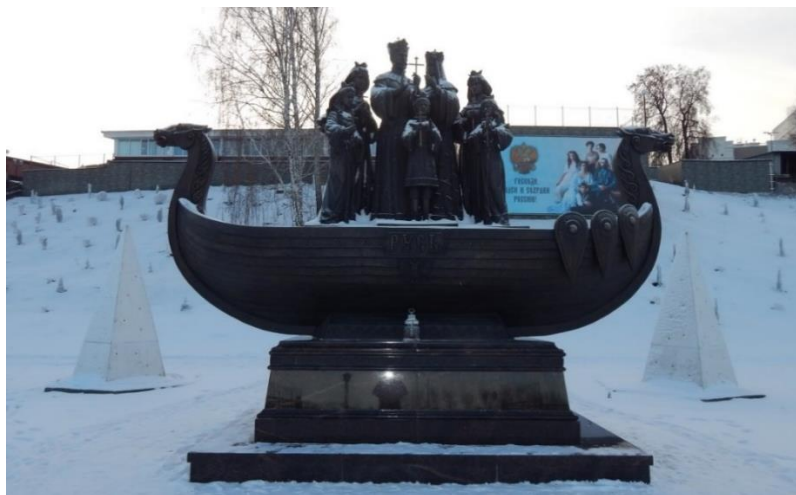
Fig. 4. Monument to the family of the former Emperor Nicholas II. Bogoroditse-Rozhdestvensky Monastery (Tyumen, 29, 25th October Str.). Photo by E. Makarov, November 24, 2022

Discussion. As a result, during writing the research paper there are 4 art objects located in Tyumen, 3 of which are not included in the Register [39]. The commemorative signs were installed in the period from 2001 to 2020. All objects are in a private area, located in the immediate vicinity of the railway station “Tura”: 2 objects on the right side and 2 – on the left (diagram).