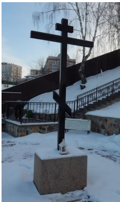
Fig. 1. The memorial sign “The Emperor's Pier”. Bogoroditse-Rozhdestvensky Convent (Tyumen, 29, 25th October St.,). Photo by E. Makarov, November 24, 2022

According to the Register Information, the wooden memorial cross is designated as a memorial sign “The Emperor's Pier”, next to which there is a memorial plaque with a text – quote from the diary of Nicholas II (Fig. 1) [39]. The complex is located on the territory of the convent, which has a fence and is restricted for free access. Therefore, according to the Regulation, the placement of this commemorative sign does not require the Administration of Tyumen to make any decisions on the installation of the object [28]. It is worth noting that the Department of Culture of the City Administration Tyumen has not received “...proposal for installation (demolition) of the Object from interested parties in accordance with the Regulation” [24].