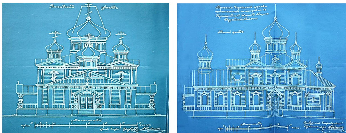
Photo 3. Design drawings of a wooden church in the Kostanay female community of Turgay region [24]